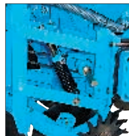
Wide and compact parallelogram with adjustable spring