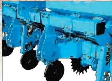
7" TOP frame

These wheels can be adjusted in height for an optimal height control of the frame when working.