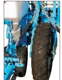
Adjustable drive wheel