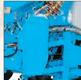
Left hand side seed spacing gearbox with interchangeable sprockets